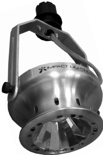
LED Lamp Fixture