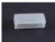
Waterproof End Cap Part Number: IL-TG-WP-ENDCAP