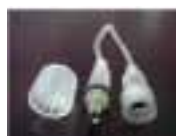
Waterproof Connectors Part Number: IL-TG-WP-Connectors